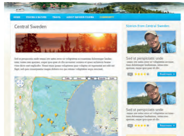
Middle level Detailed information about the country's three geographic regions.