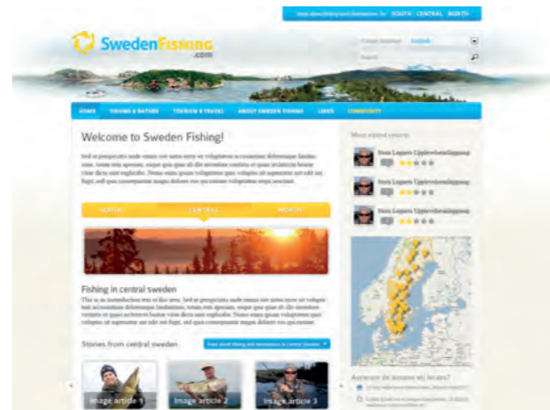
Top level General information about Sweden, including fishing.

There is even a forum linked to the site where you can log in and exchange experiences and fishing tips with other visitors and fishing facilities in Sweden. There is also a link to www.VisitSweden.com, the official Swedish tourism and travel information site. SwedenFishing is their partner when it comes to fishing tourism.